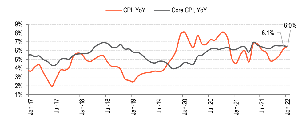
Fig 3 - Core CPI edged marginally lower in Jan'22