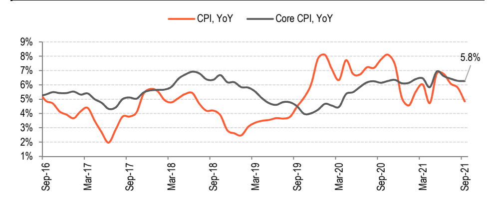
Fig 3 - Core inflation sticky