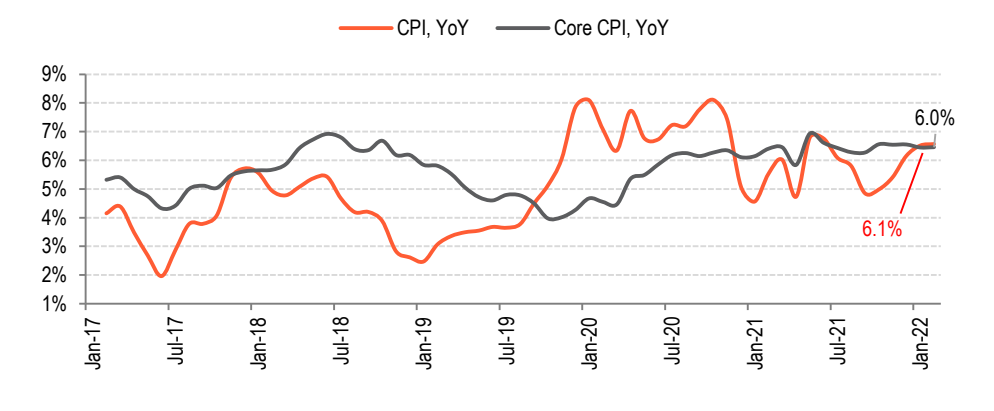
Fig 3 - Core CPI sticky at 6%