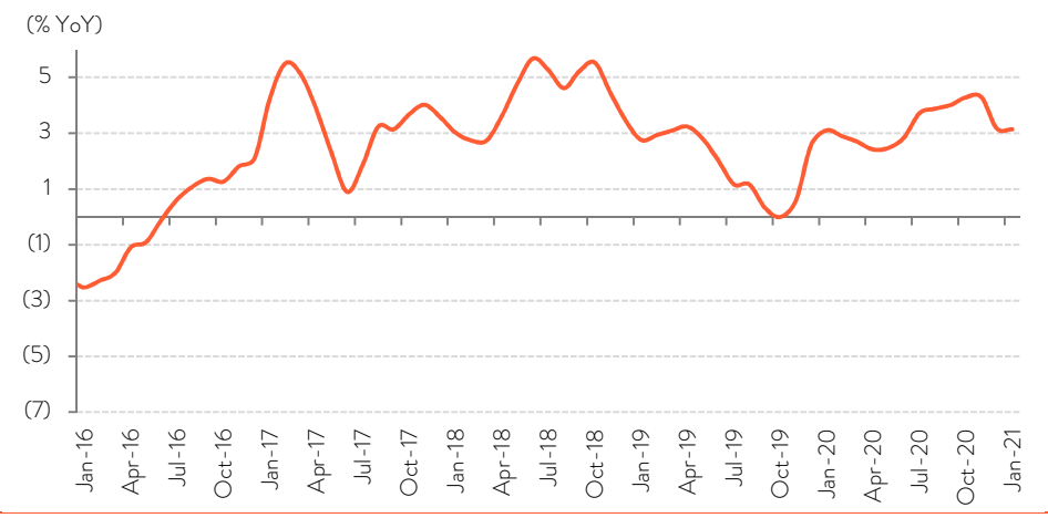
FIG 3 - HEADLINE WPI TO COOL DOWN GOING FORWARD