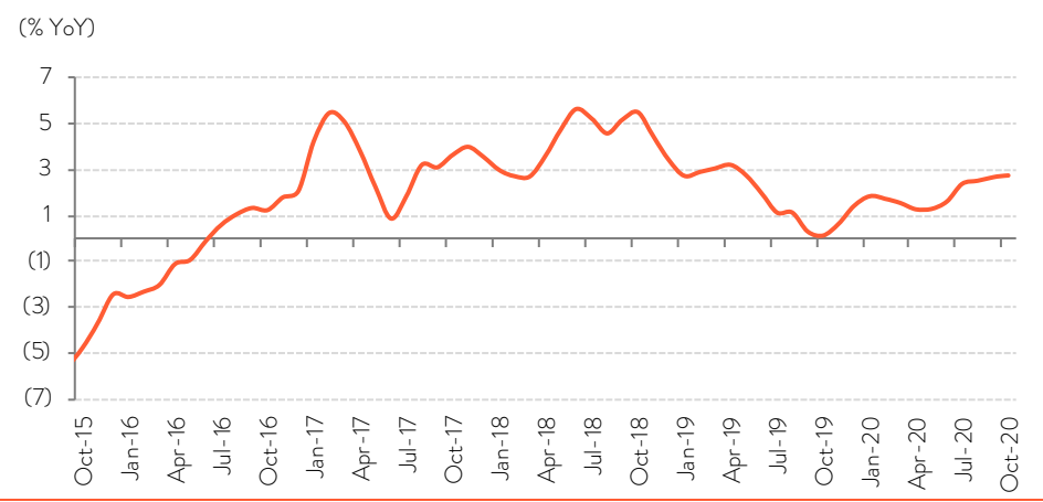
FIG 3 - HEADLINE WPI TO PICK UP IN H2FY20